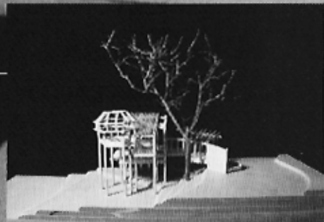
Pleasure house Timothy Lo