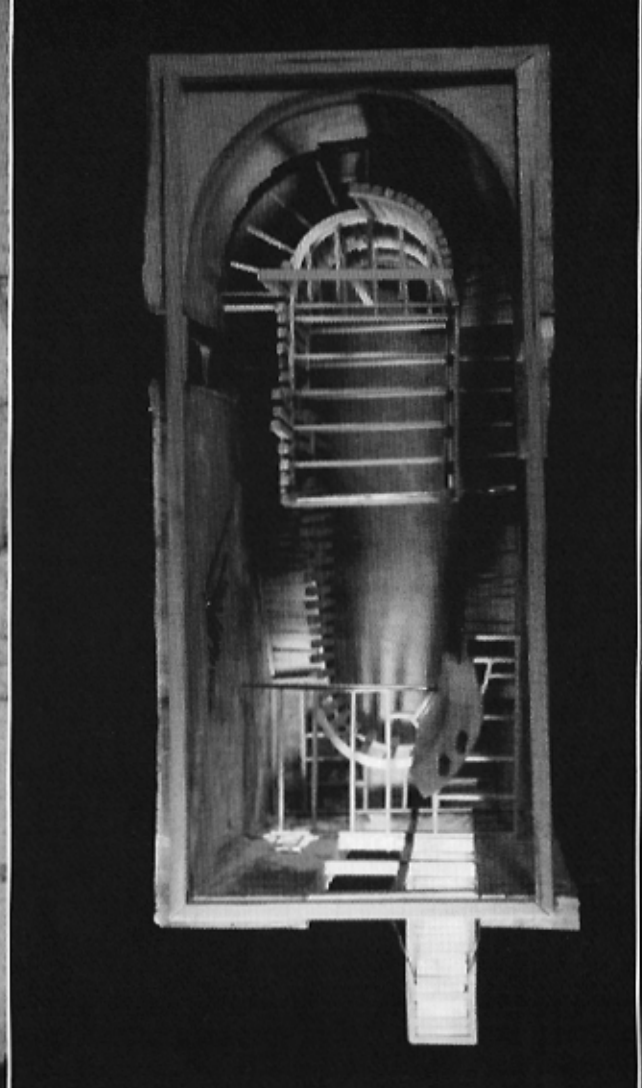
Background: Conceptual drawing